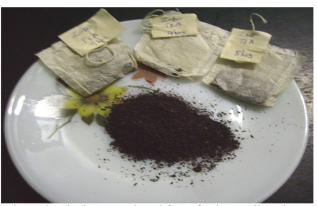
Figure 2. Black tea produced from fresh Roselle calyxes

Roselle calyxes were processed into tea using the general method for black tea production shown in Figure 1. This involved cleaning the calyxes manually to remove debris, stalks, stones and other impurities and then withering by spreading them thinly on wire nets for 18 hours in a room. The moisture content of the calyxes after withering was checked to ensure it was in the range (55-70%) recommended in the literature (Wilson, 1999). For experimental purposes the withered calyxes were macerated using a laboratory mortar and pestle and macerated calyxes were then kept in an incubator set at 27°C to be fermented. Samples were fermented for 3, 4 and 5 hours, respectively. During this process the calyxes were kept moist by wetting at intervals. Fermented calyxes were dried in an oven set at about 90°C.